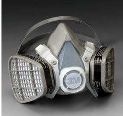
3M Product No. 5201 3M™ Half Facepiece Disposable Respirator Assembly 5201, Organic Vapor, Medium 3M ID 70070314466 UPC 50051138215717